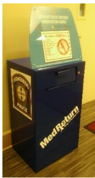
Hamburg Drop Box

Your drinking water providers work around the clock to provide top quality water to every tap. It is a task that all water systems take very seriously. They work hard to protect our water resources, which are the heart of our community, our way of life and our children's future.